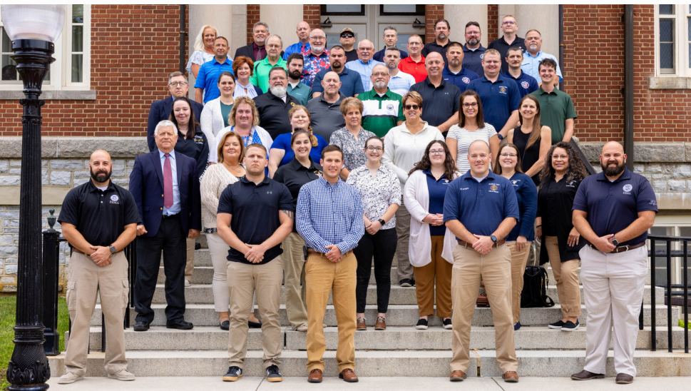
Defiance County, Ohio - Integrated Emergency Management Course (IEMC) Emergency Management Institute, Emmitsburg, MD - August 2023